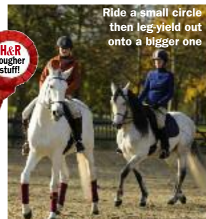
Ride a small circle then leg-yield out onto a bigger one